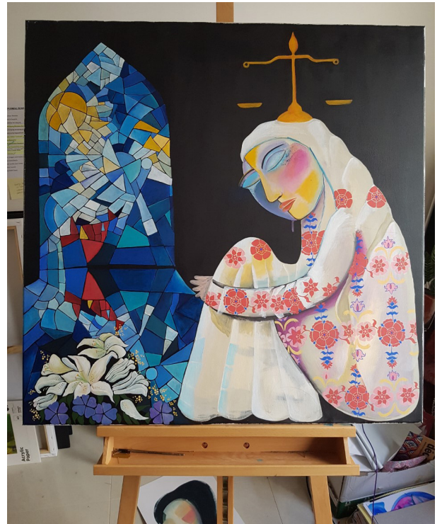
The weight of justice (incomplete) , 2010, mixed media.