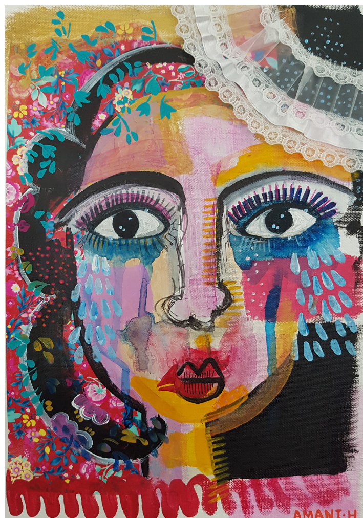
Bride 3 , 2019, mixed media. Image courtesy of the artist