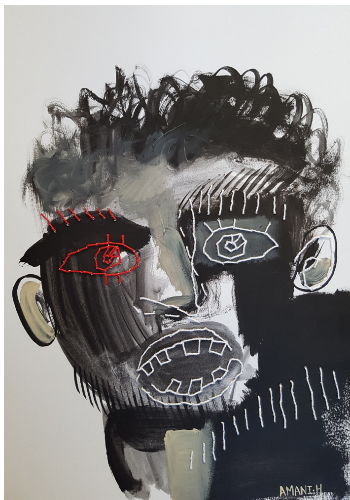
This is all your fault , 2019, mixed media.