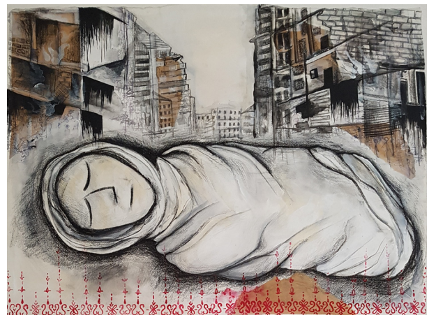
War stories I , 2014, mixed media.