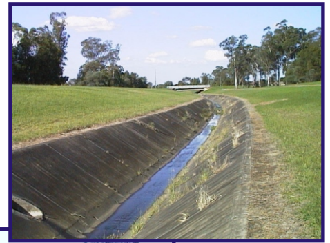
Before - the concrete drain

The Project did not attempt to return the stream to its original pristine condition but rather focused on creating a system that supports a more sustainable environment in harmony with today's human landscape..