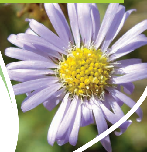
Purple burr-daisy ( Calotis cuneifolia )