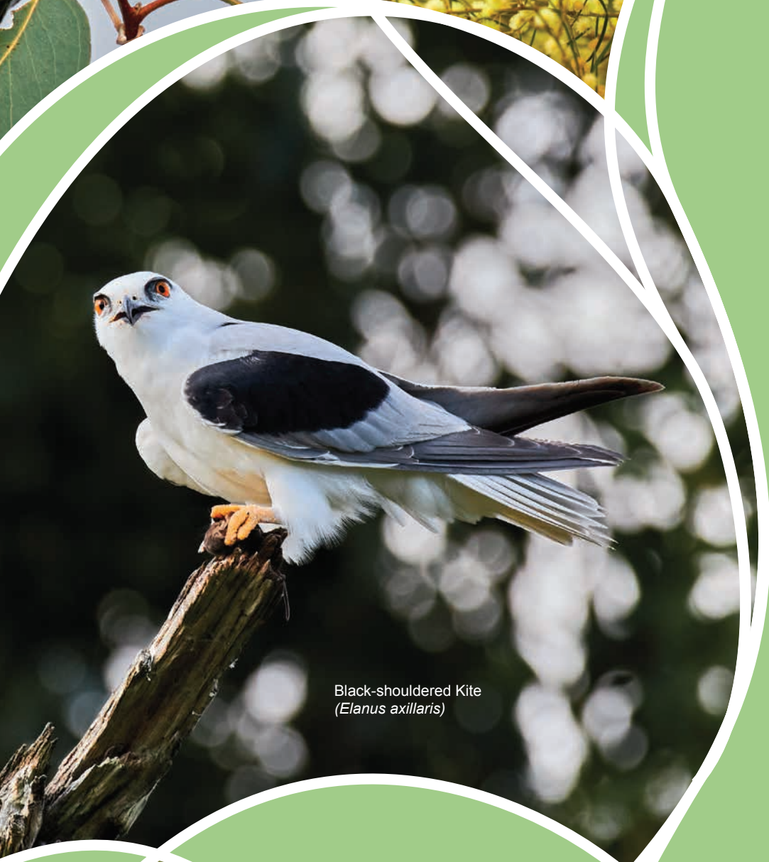
Black-shouldered Kite ( Elanus axillaris )