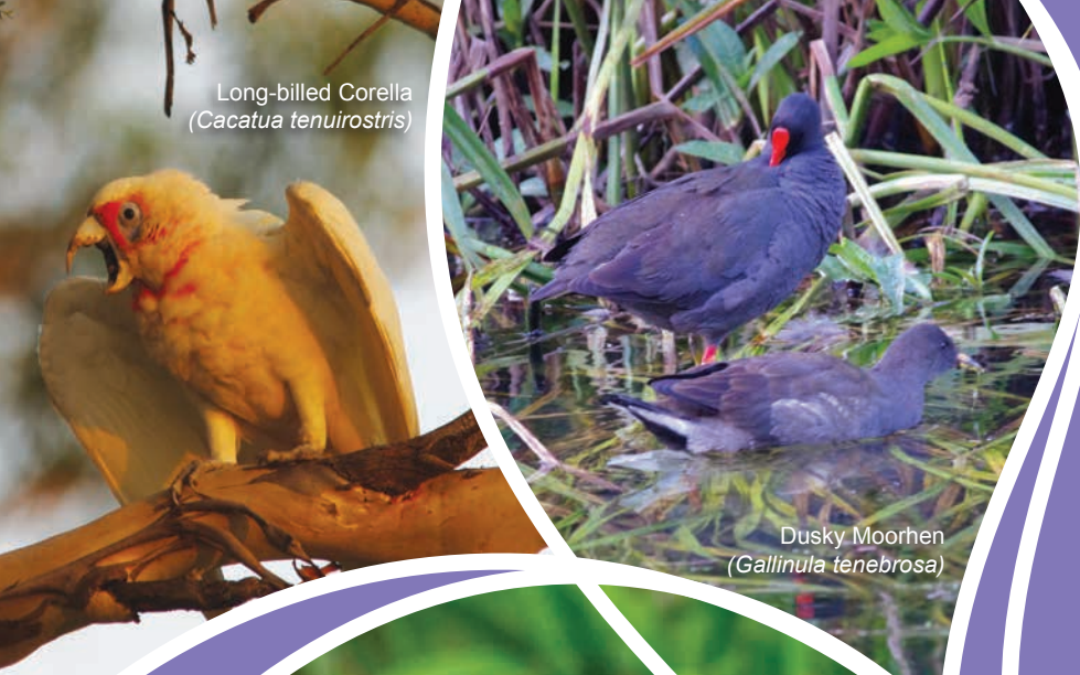
Long-billed Corella ( Cacatua tenuirostris )