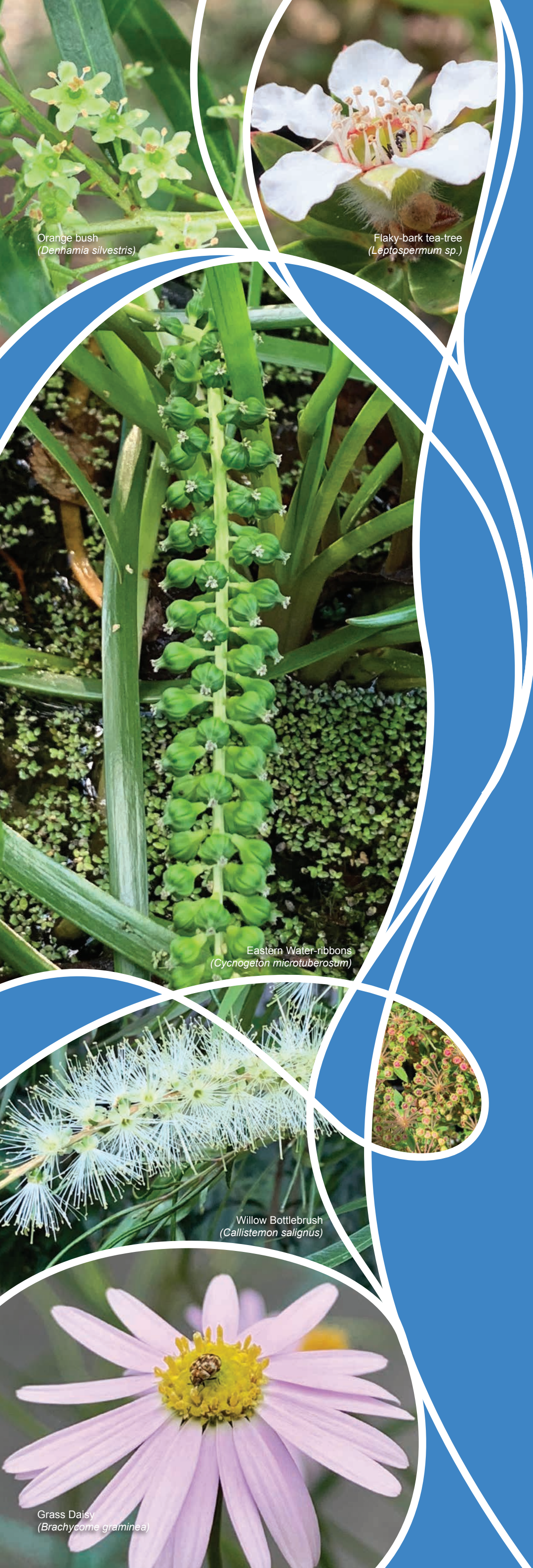
Orange bush ( Denhamia silvestris )