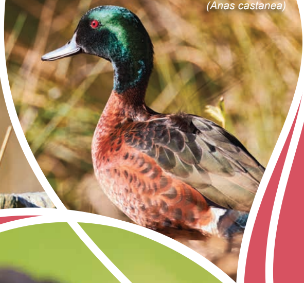
Chestnut Teal ( Anas castanea )