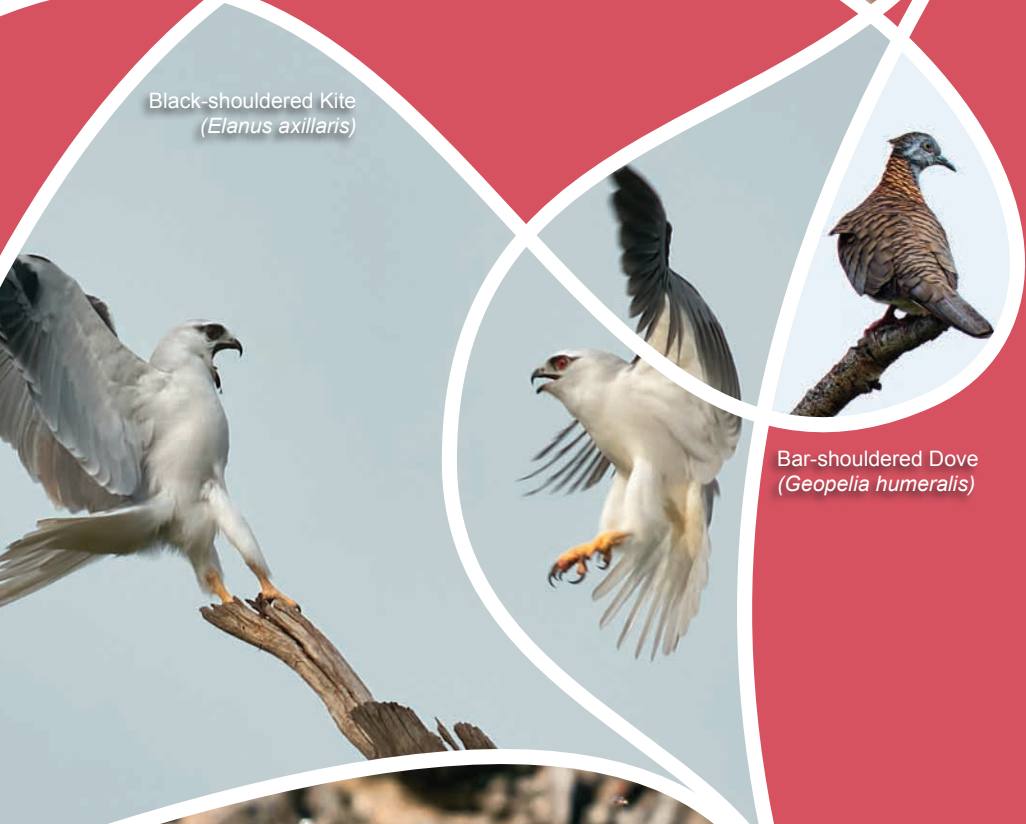
Bar-shouldered Dove ( Geopelia humeralis )