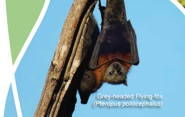
Grey-headed Flying-fox ( Pteropus poliocephalus )