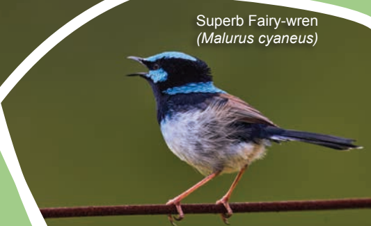
Superb Fairy-wren (Malurus cyaneus)