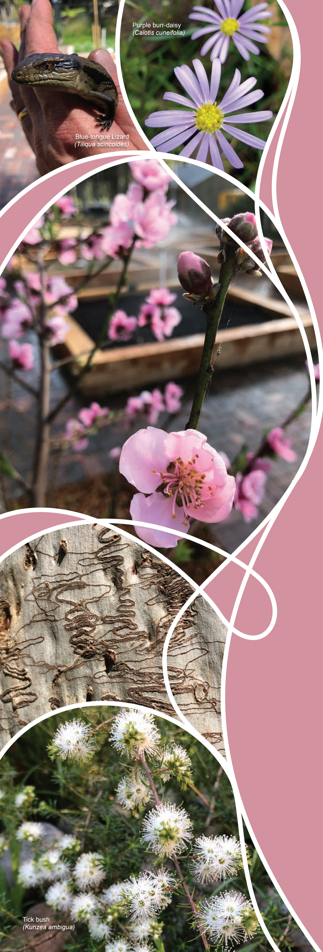
Purple burr-daisy ( Calotis cuneifolia )