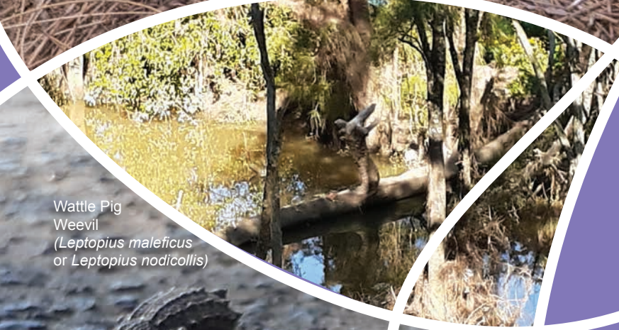
Wattle Pig Weevil ( Leptopius maleficus or Leptopius nodicollis )