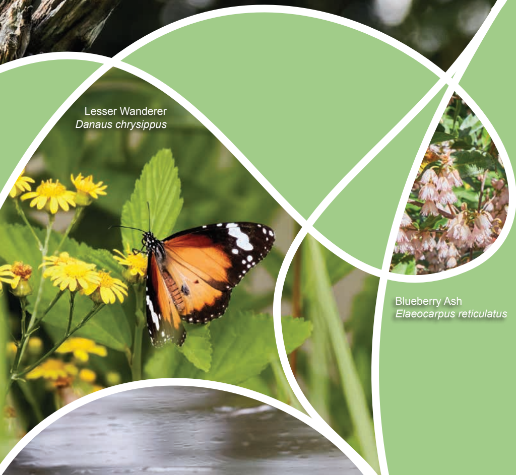
Lesser Wanderer Danaus chrysippus