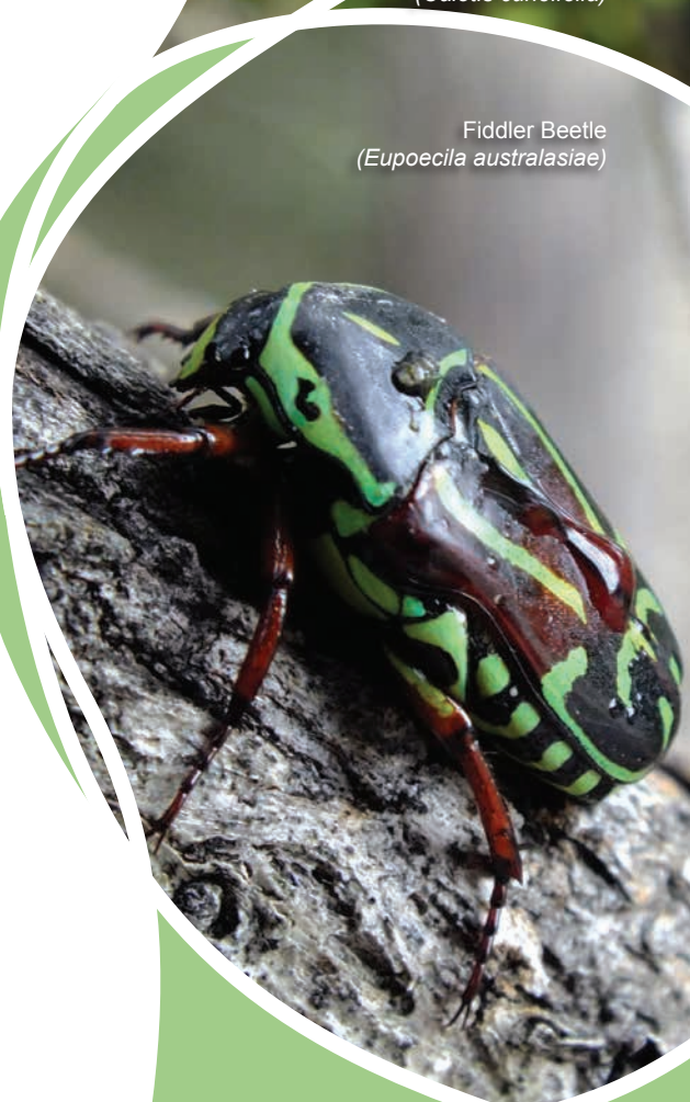
Fiddler Beetle ( Eupoecila australasiae )