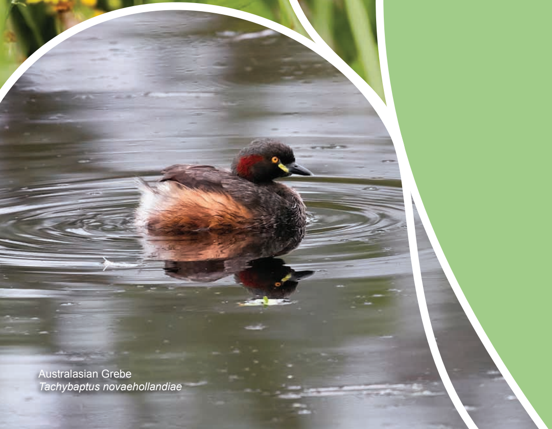
Australasian Grebe Tachybaptus novaehollandiae