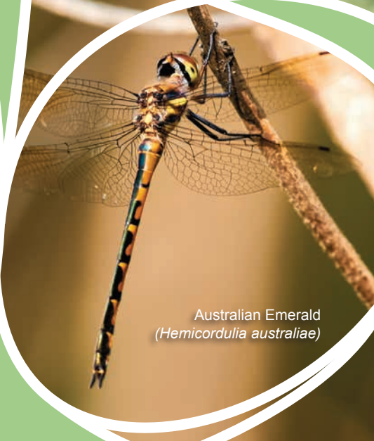
Australian Emerald (Hemicordulia australiae)