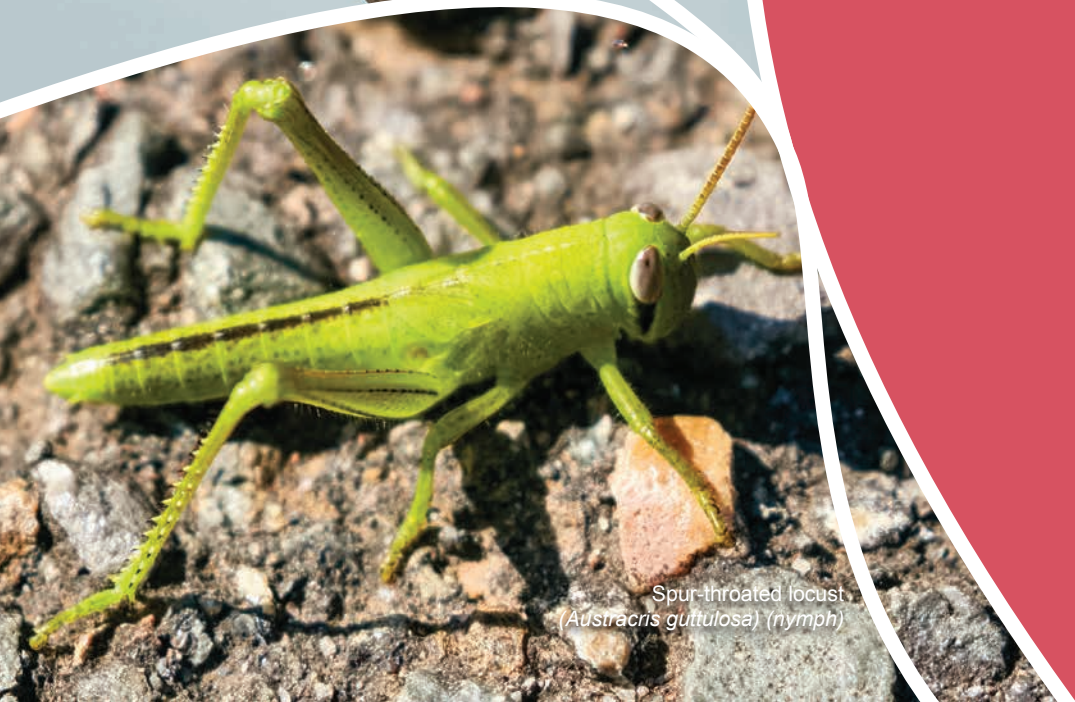
Spur-throated locust ( Austrotrichia guttulosa ) (nymph)