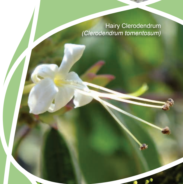
Hairy Clerodendrum ( Clerodendrum tomentosum )