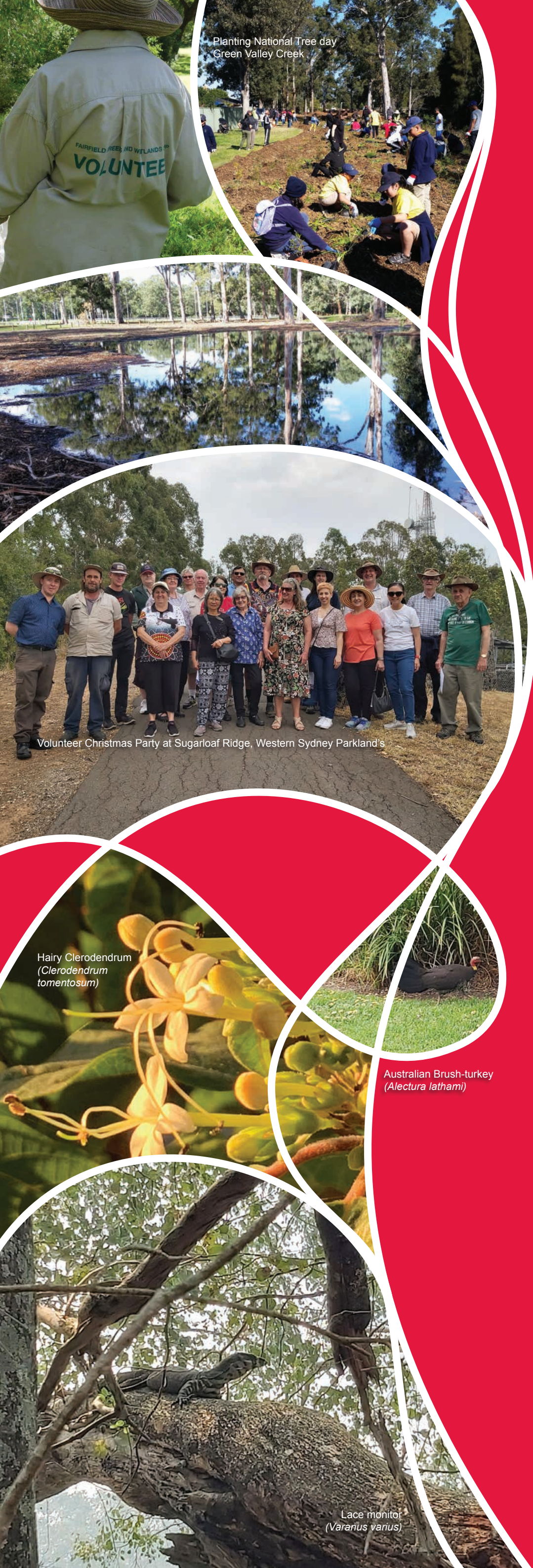
Planting National Tree day Green Valley Creek