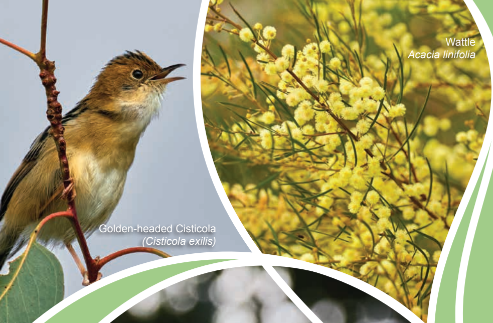
Golden-headed Cisticola ( Cisticola exilis )