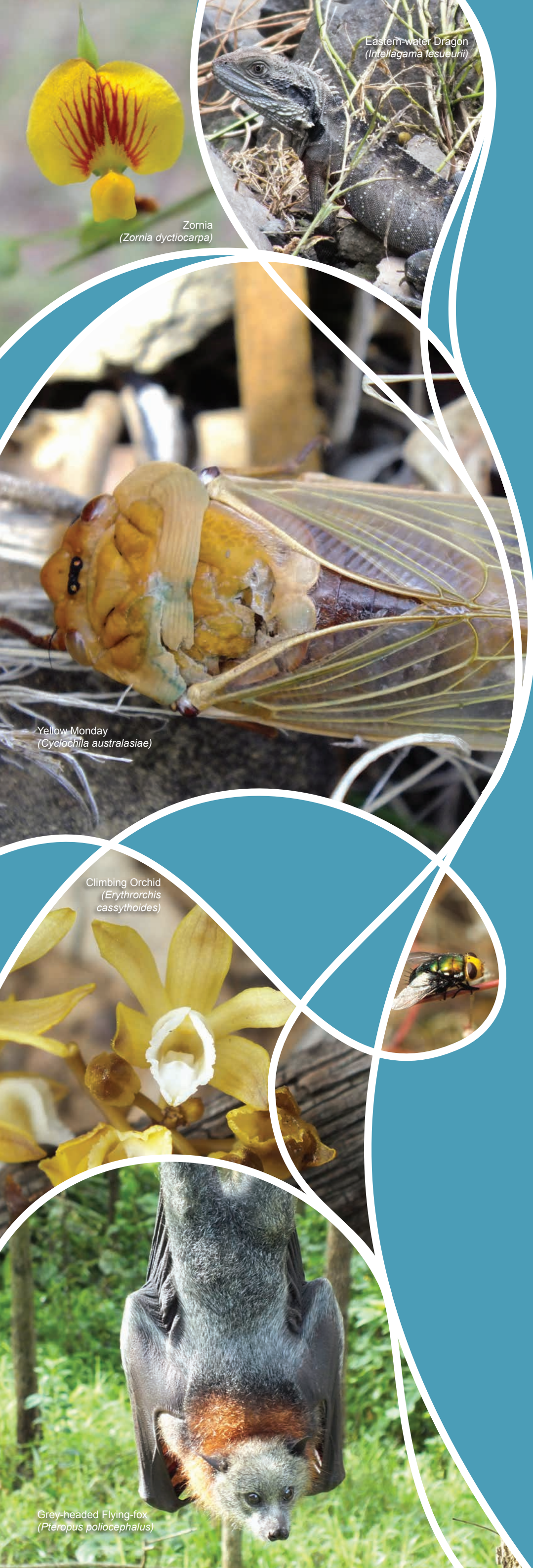
Zornia ( Zornia dyctiocarpa )