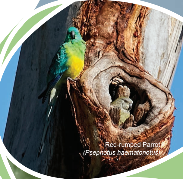
Red-rumped Parrot (Psephotus haematonotus)