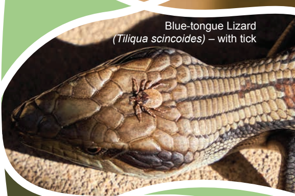
Blue-tongue Lizard (Tiliqua scincoides) – with tick