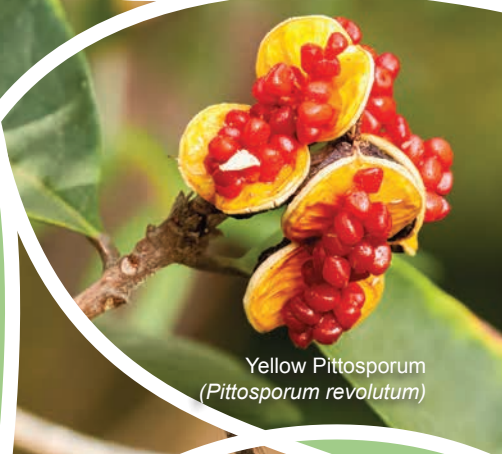
Yellow Pittosporum (Pittosporum revolutum)