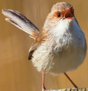
Superb Fairy-wren ( Malurus cyaneus )