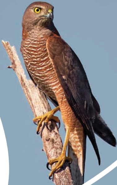
Brown Goshawk (Accipiter fasciatus)