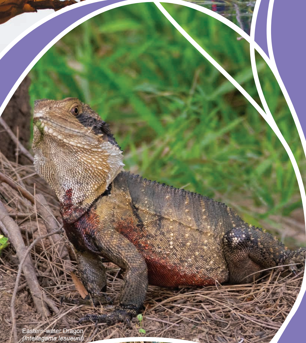
Eastern-water Dragon ( Intellagama lesueurii )