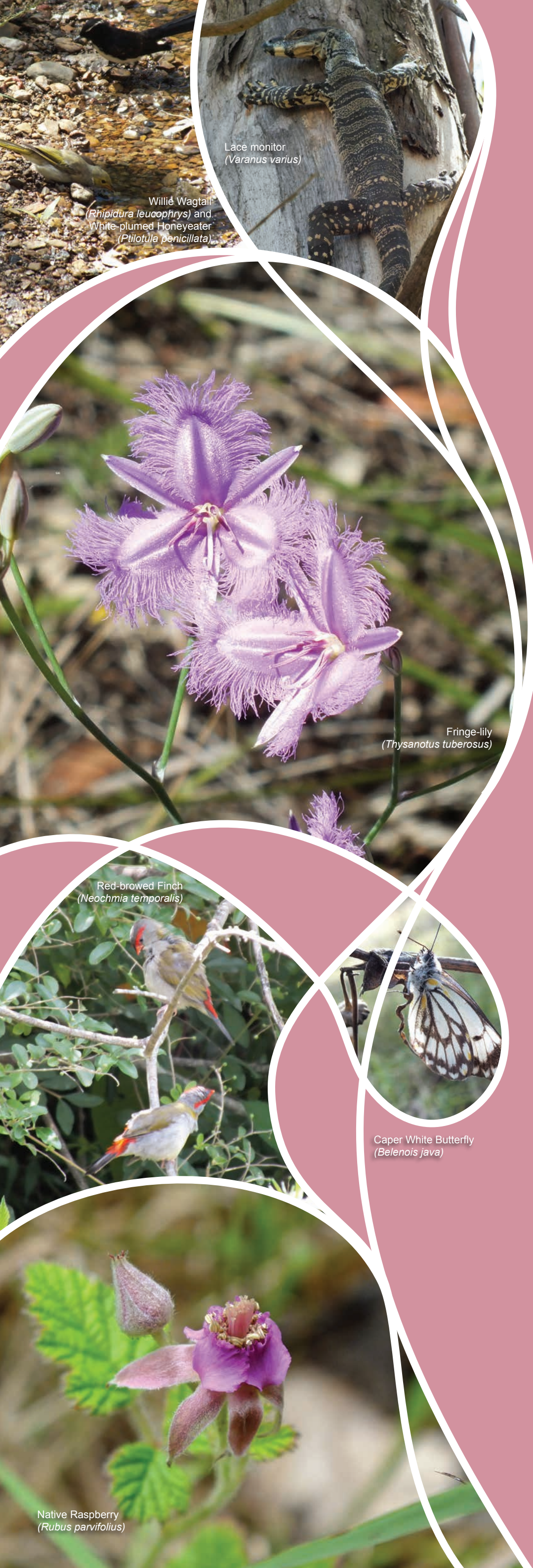
Lace monitor ( Varanus varius )