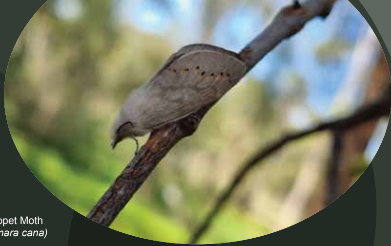
Lappet Moth ( Pinara cana )