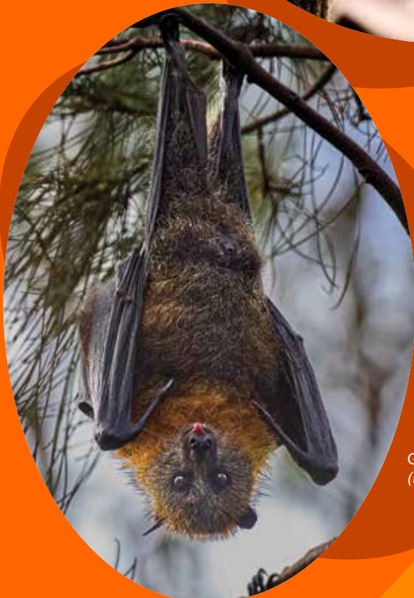
Grey Headed Flying Fox ( Pteropus poliocephalus )