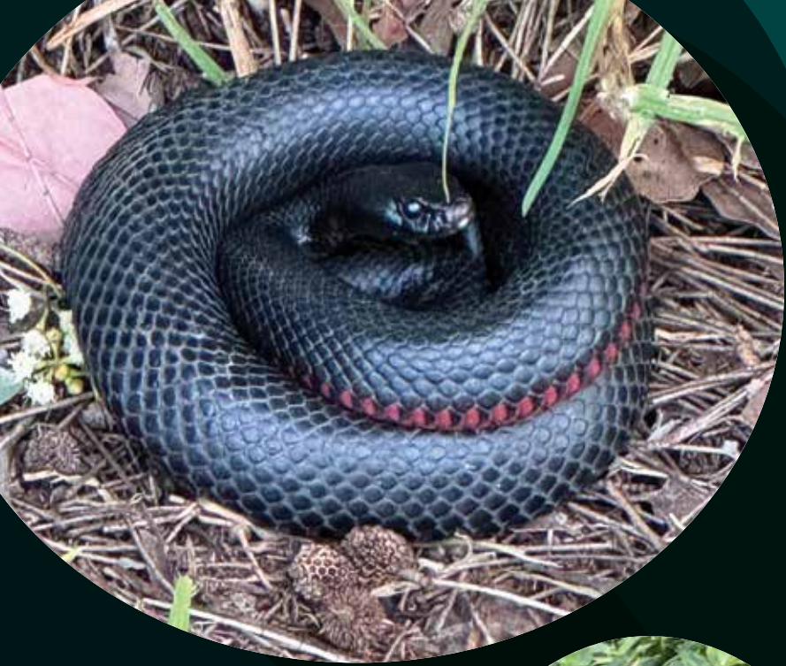
Red-bellied Black Snake ( Pseudechis porphyriacus )