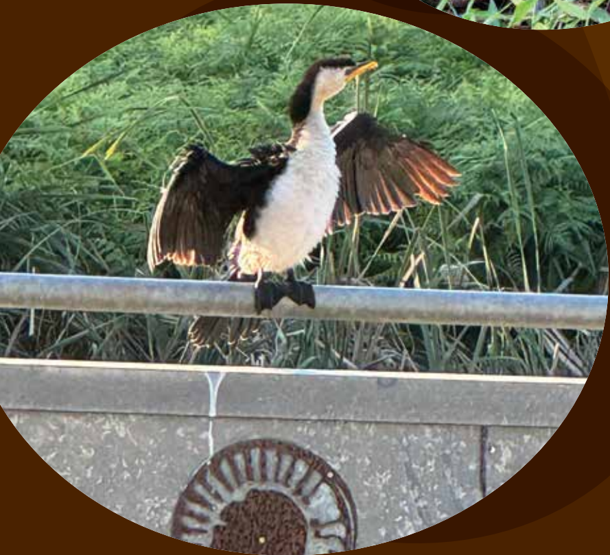
Little Pied Cormorant ( Microcarbo melanoleucos )