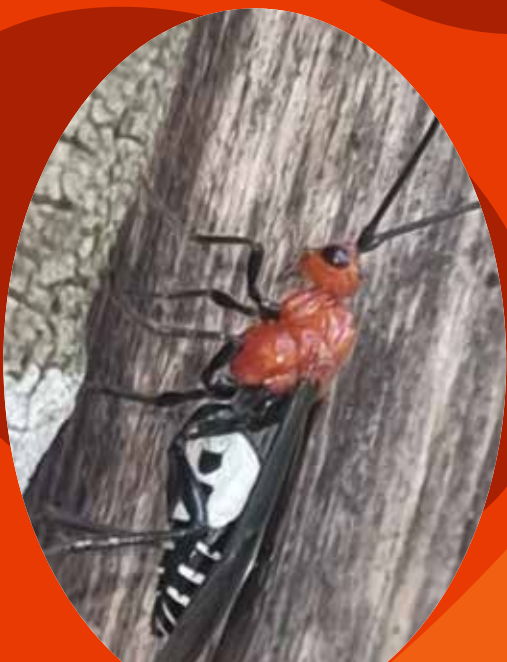
White Flank Orange Braconid wasp ( Callibracon sp.)