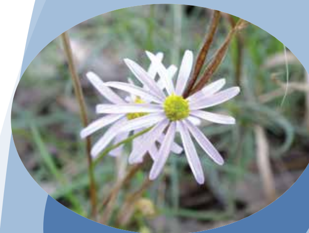
Rock Daisy ( Brachycome angustifolia var. angustifolia )