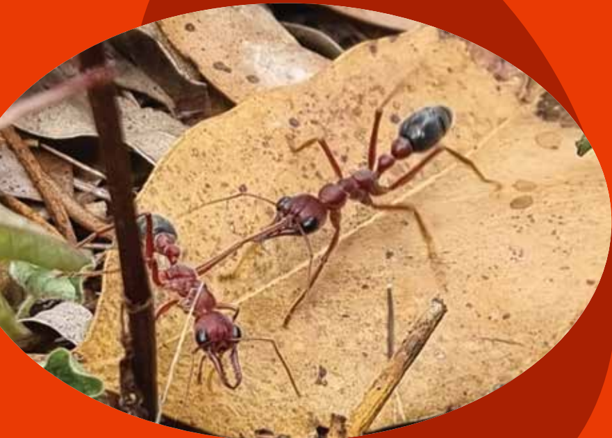
Giant Bulldog Ant ( Myrmecia brevinoda )