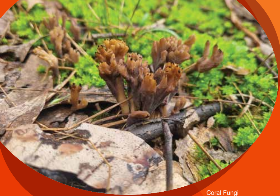
Coral Fungi ( Clavulina vinaceocervina )