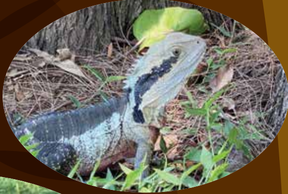
Australian Water Dragon ( Intellagama lesueurii )