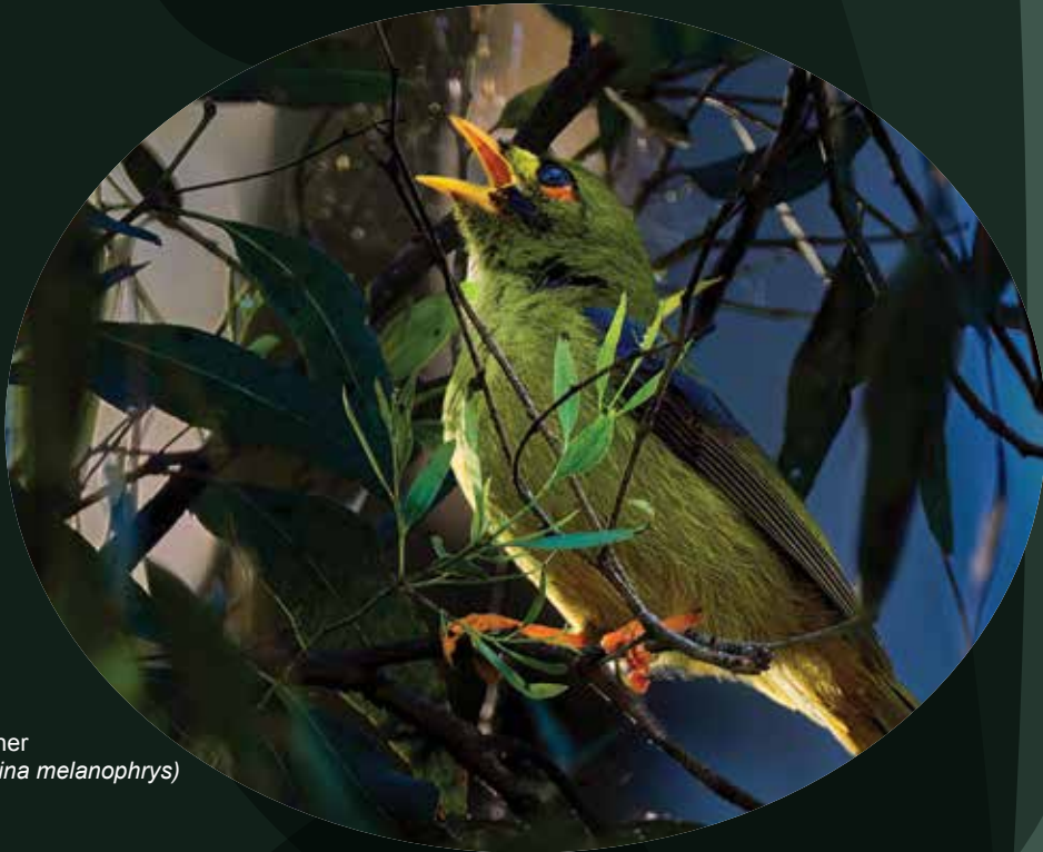
Bell Miner ( Manorina melanophrys )