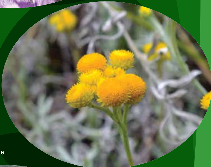
Yellow Buttons ( Chrysocephalum apiculatum )