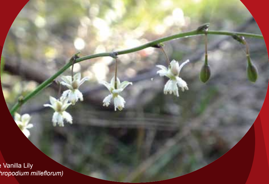
Pale Vanilla Lily ( Arthropodium milleflorum )