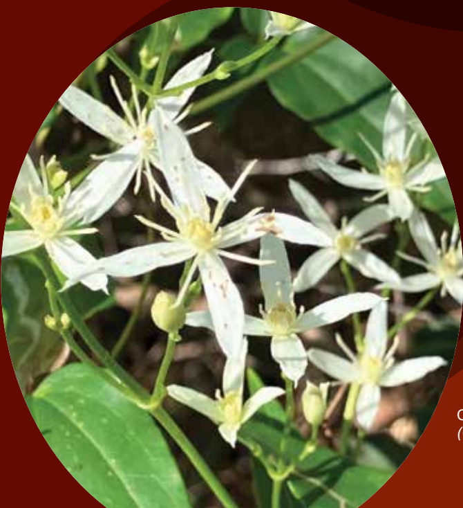
Clematis ( Clematis glycinoides )