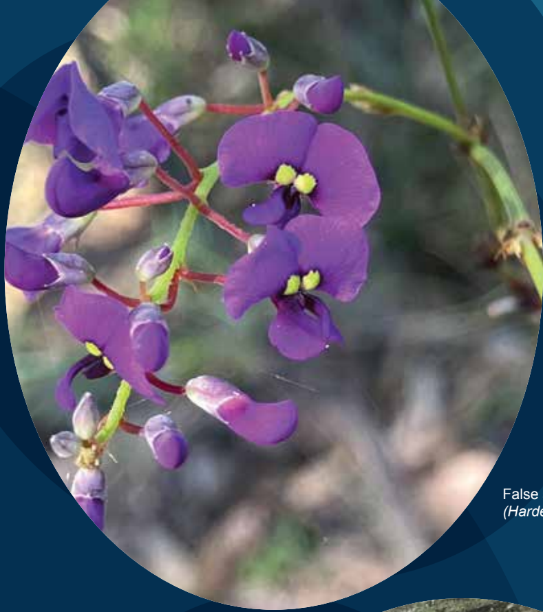
False sarsaparilla ( Hardenbergia violacea )