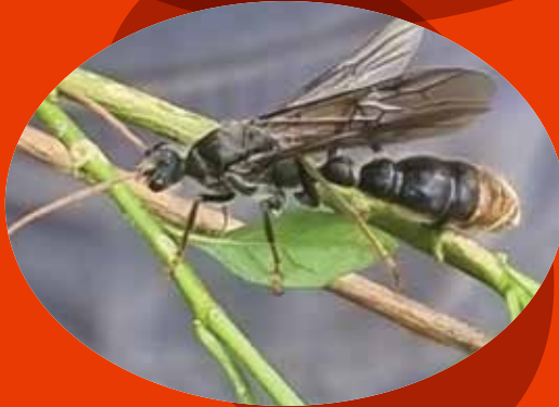
Male Bull Ant ( Myrmecia tarsata )