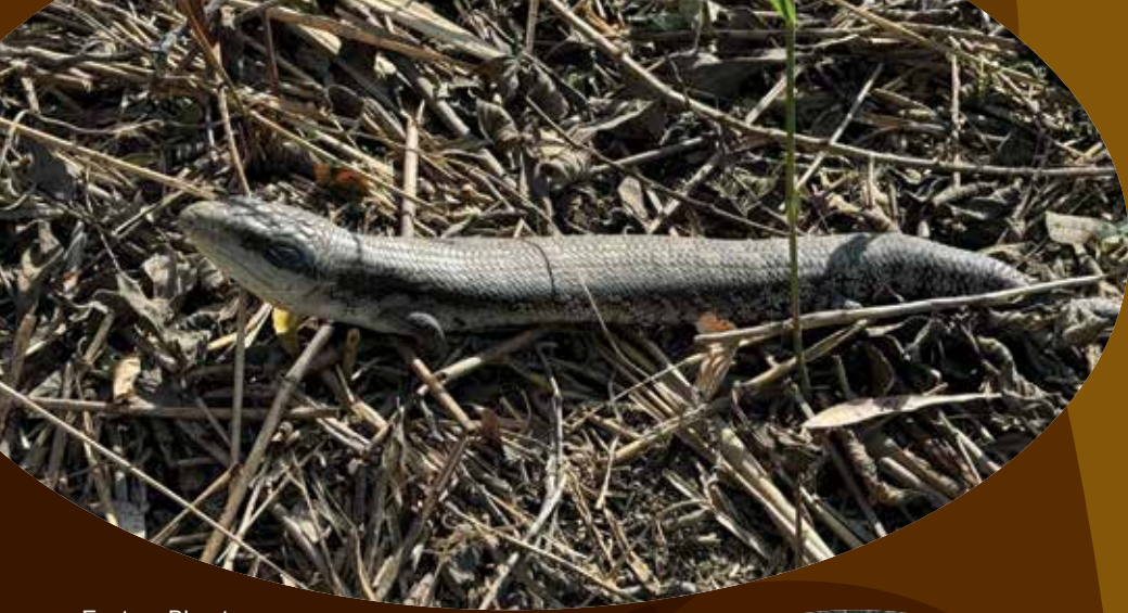
Eastern Blue-tongue ( Tiliqua scincoides )