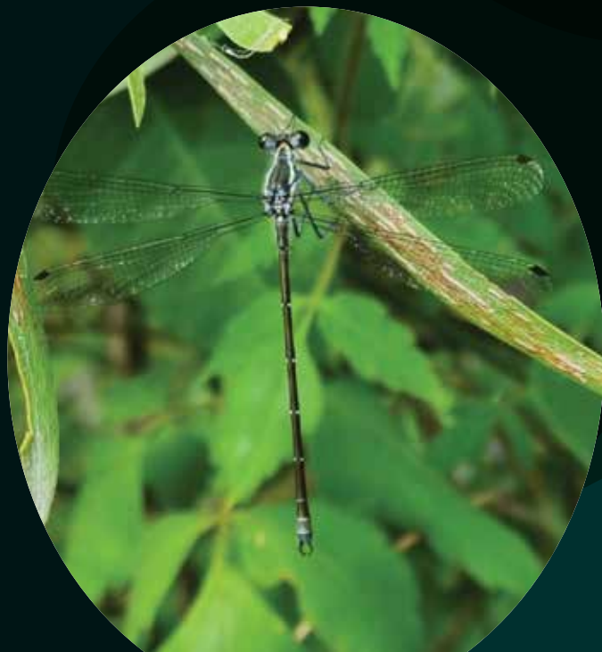
Common Flatwing ( Austroargiolestes icteromelas )