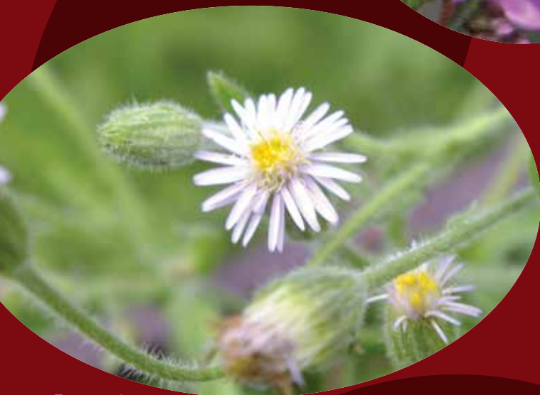
Fuzzweed ( Vittadinia sp.)