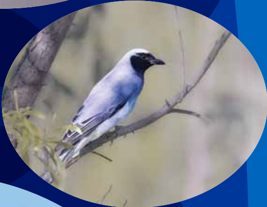
Black-faced Cuckoo-shrike ( Coracina novaehollandiae )