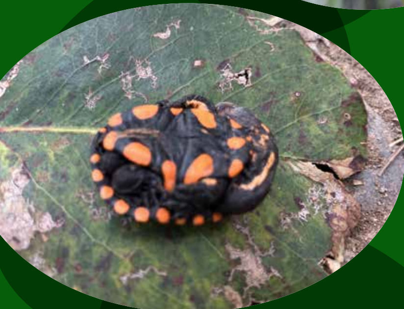
Baby Eastern Long-necked Turtle ( Chelodina longicollis )