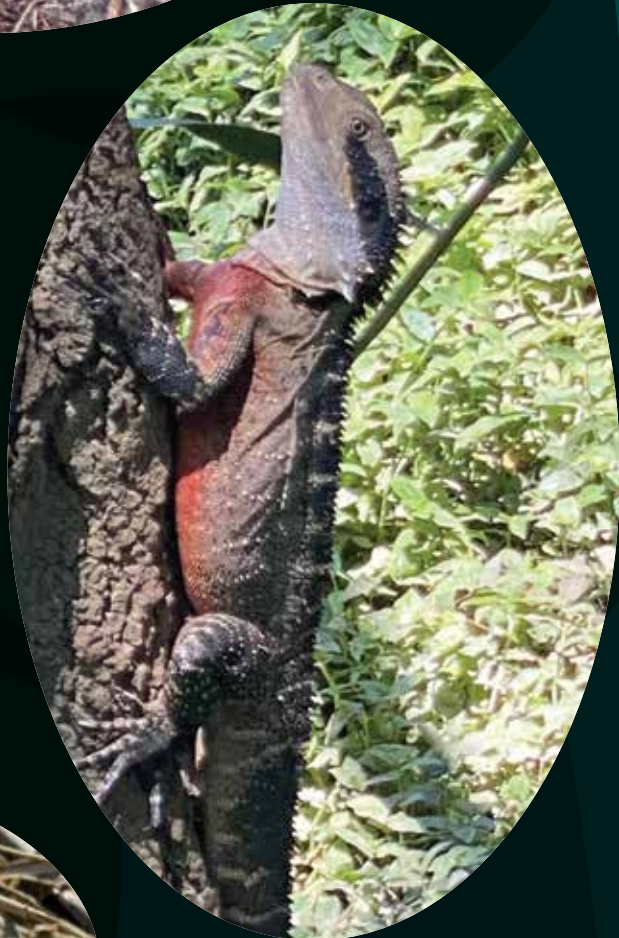
Australian Water Dragon ( Intellagama lesueurii )