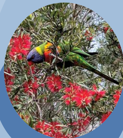
Rainbow Lorikeet ( Trichoglossus moluccanus )