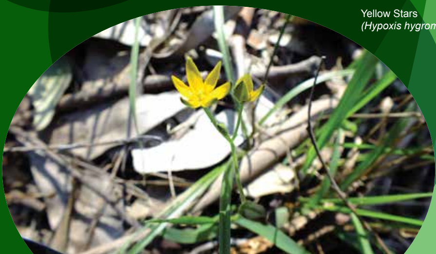
Yellow Stars ( Hypoxis hygrometrica )