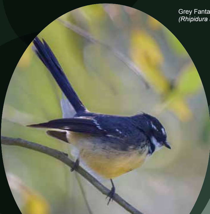
Grey Fantail ( Rhipidura albiscapa )