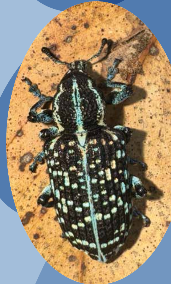
Botany Bay Weevil ( Chrysolopus spectabilis )