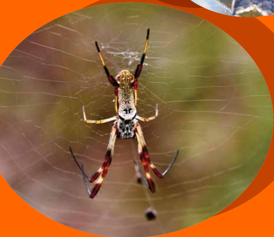
Golden Orb Weaving Spider ( Nephila sp. )