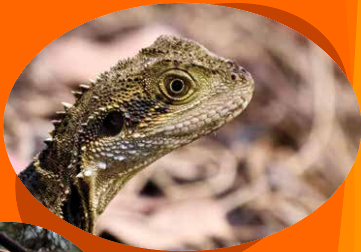
Baby Australian Water Dragon ( Intellagama lesueurii )