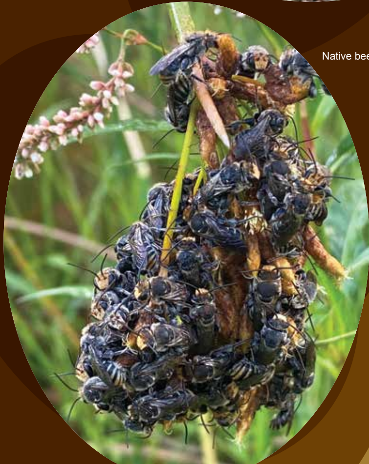
Native bees roosting