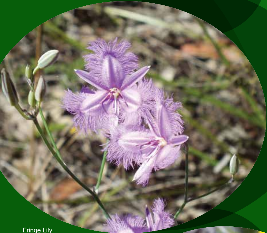
Fringe Lily ( Thysanotus tuberosus )