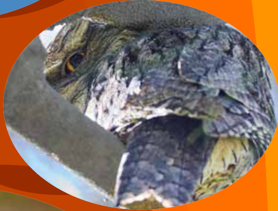
Tawny Frogmouth ( Podargus strigoides )