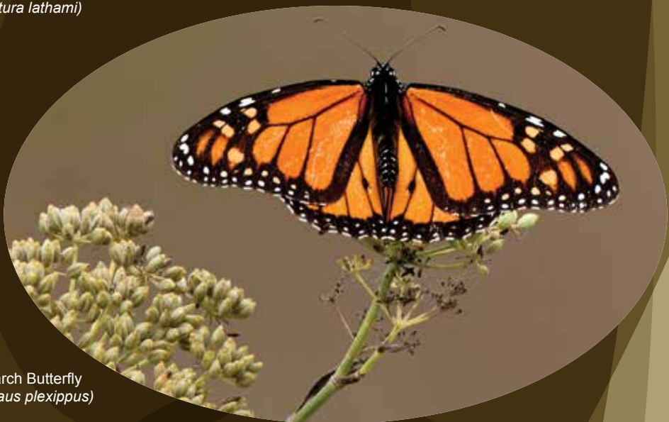
Monarch Butterfly ( Danaus plexippus )