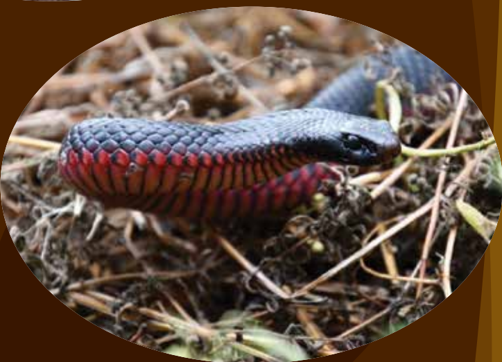
Red-bellied Black Snake ( Pseudechis porphyriacus )