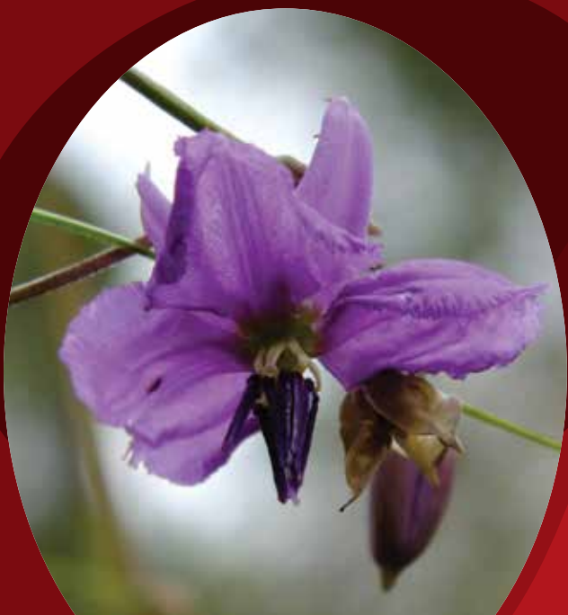
Chocolate Lily ( Arthropodium strictum )