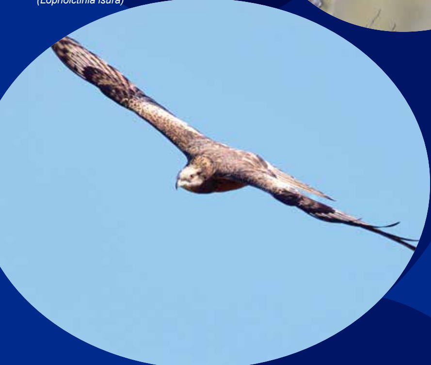
Square-tailed Kite ( Lophoictinia isura )