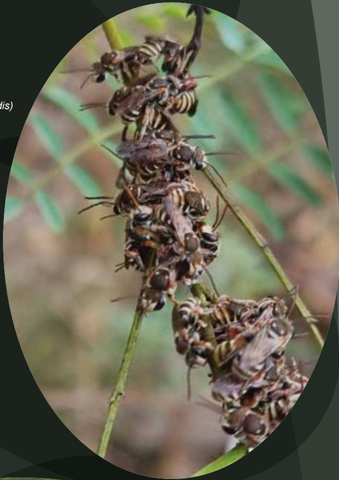
Sweat Bee ( Lipotriches flavoviridis )