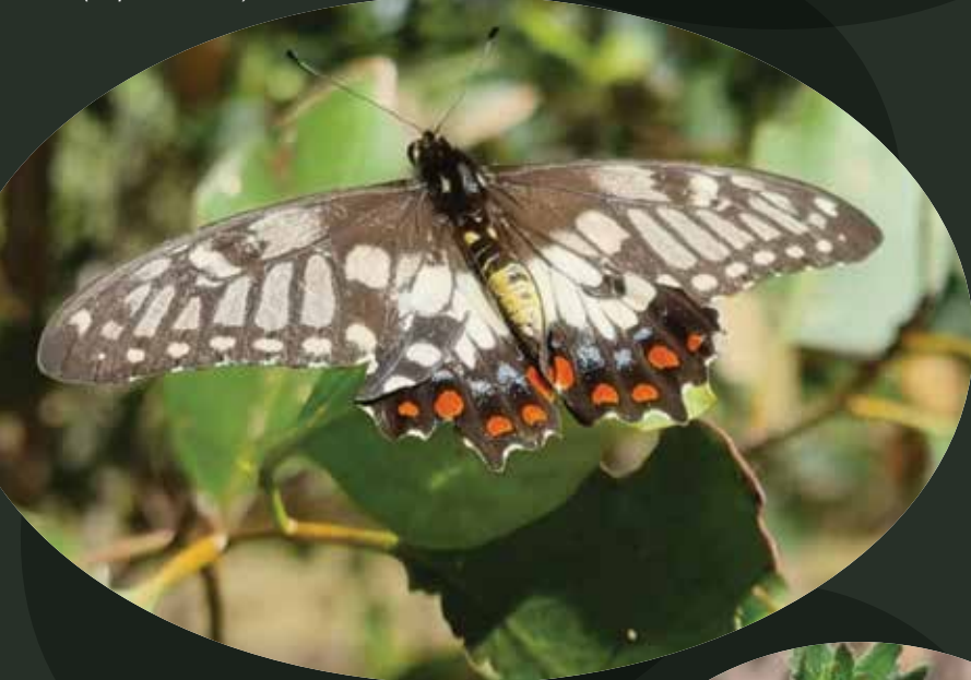
Dainty Swallowtail Butterfly ( Papilio anactus )