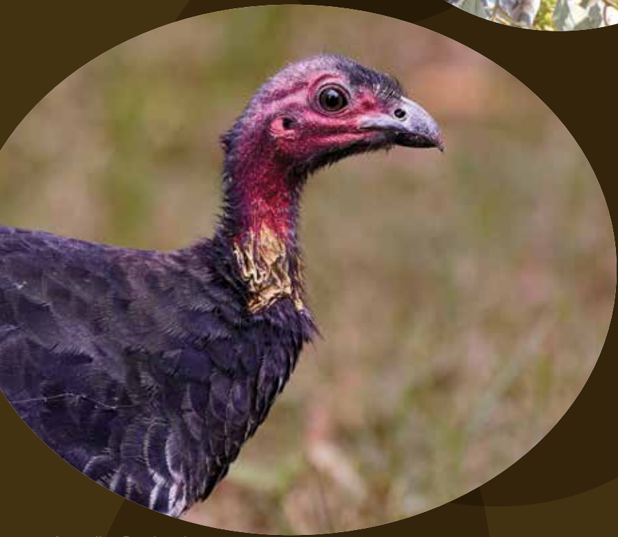
Australian Brush-turkey ( Alectura lathami )