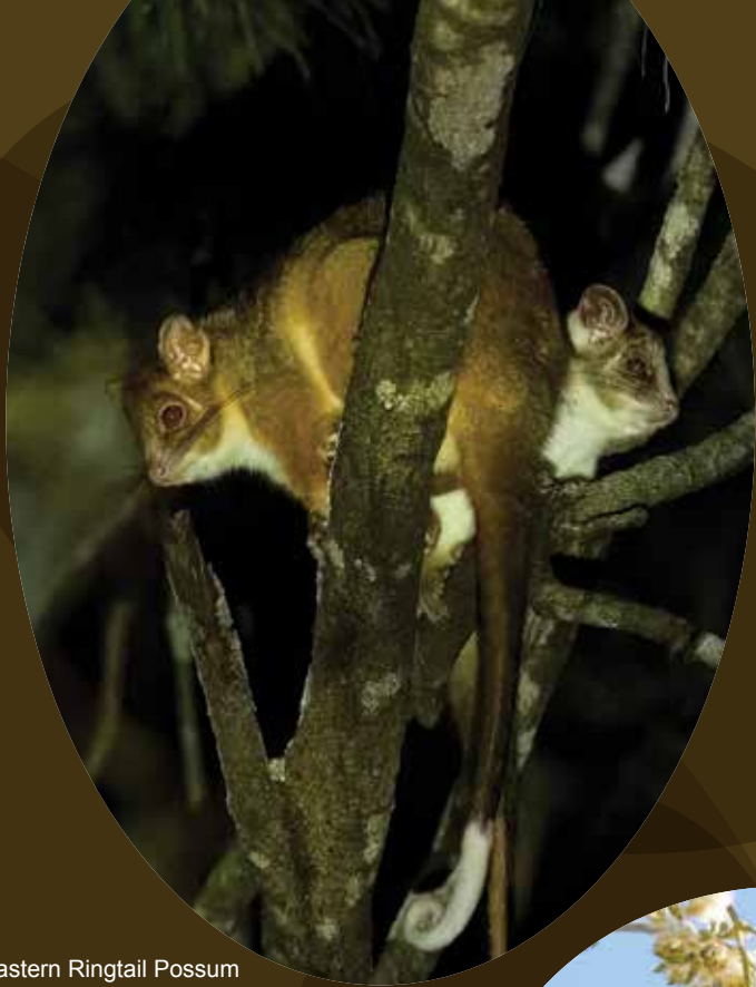
Eastern Ringtail Possum ( Pseudocheirus peregrinus )