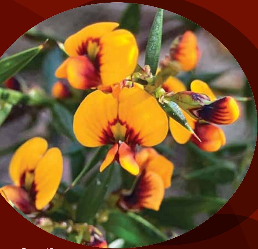
Eggs and Bacon ( Daviesia ulicifolia )