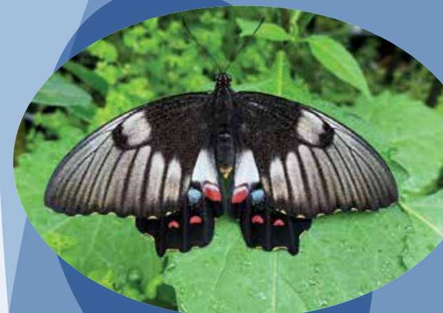
Orchard Swallowtail Butterfly ( Papilio aegaeus )