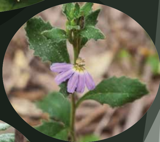
Fan Flower ( Scaevola albida var. albida )