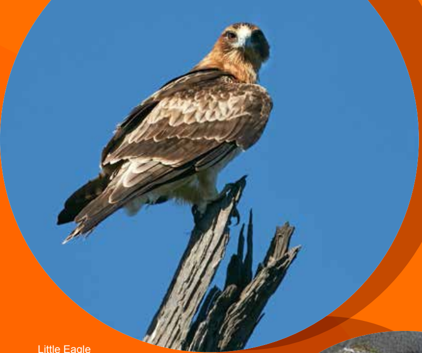
Little Eagle ( Hieraaetus morphnoides )