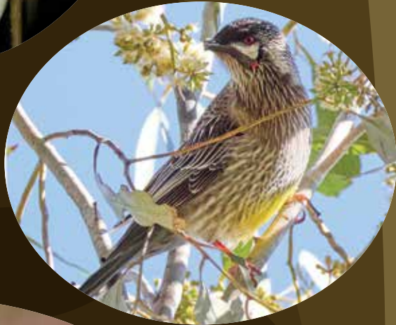
Red Wattlebird ( Anthochaera carunculata )