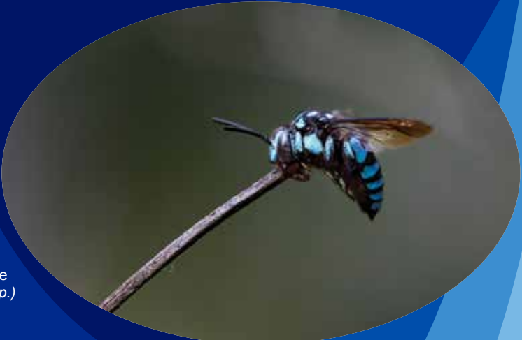
Cuckoo bee ( Thyreus sp. )