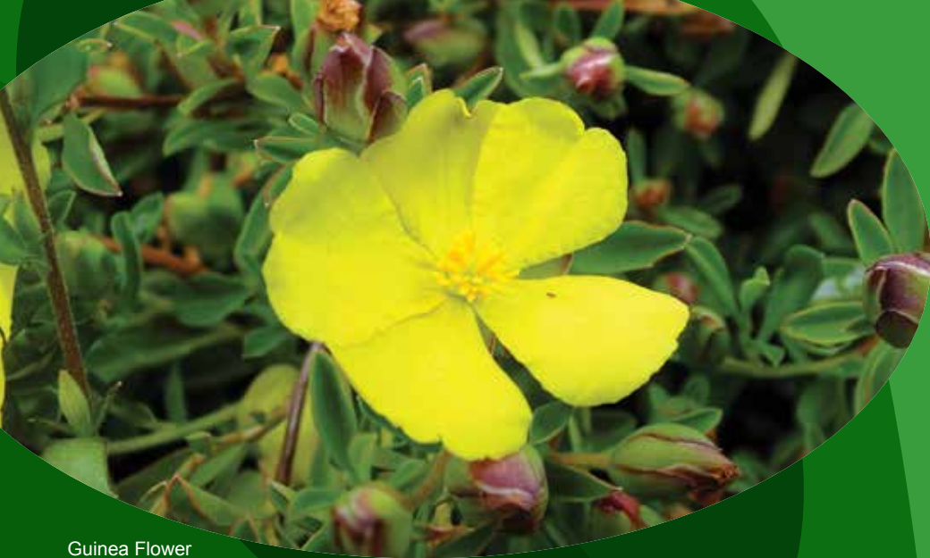
Guinea Flower ( Hibbertia sp.)