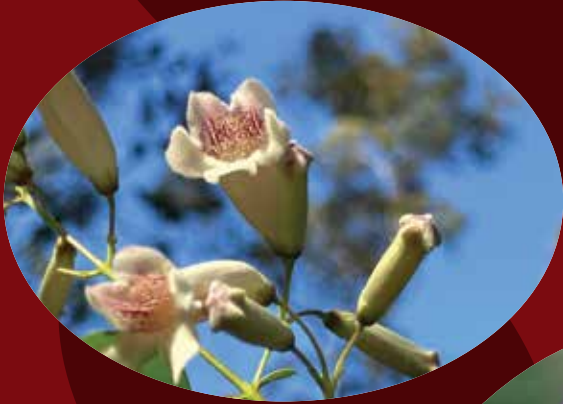
Wonga Wonga Vine ( Pandorea pandorea )