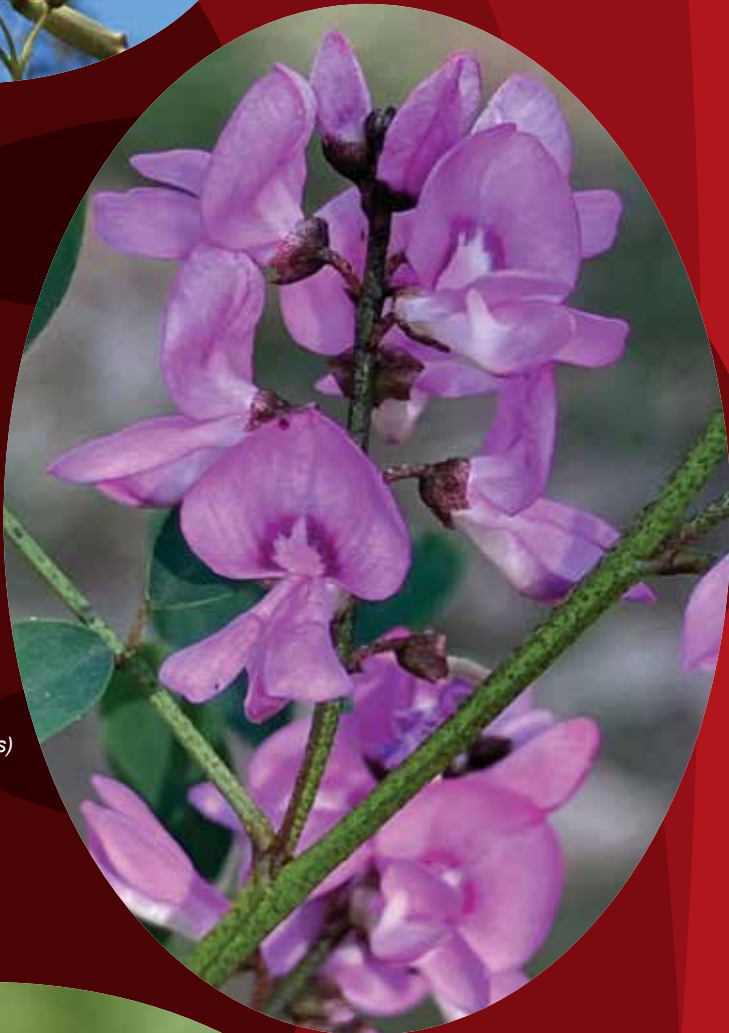
Native Indigo ( Indigofera australis )