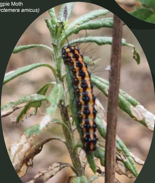
Magpie Moth ( Nyctemera amicus )