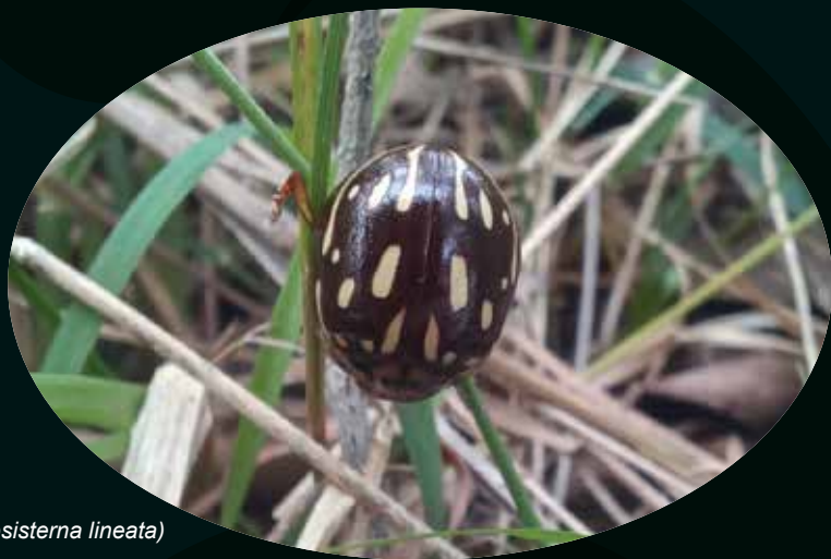
( Paropsisterna lineata )