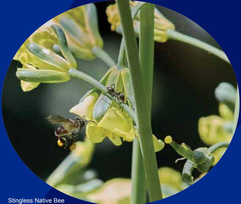
Stingless Native Bee