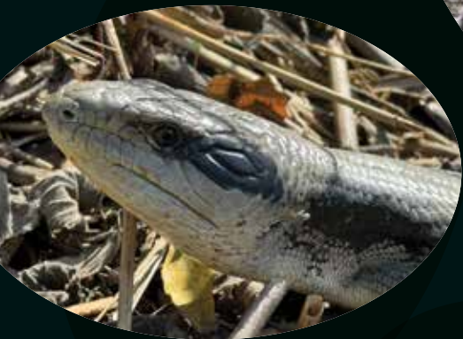
Eastern Blue-tongue ( Tiliqua scincoides )