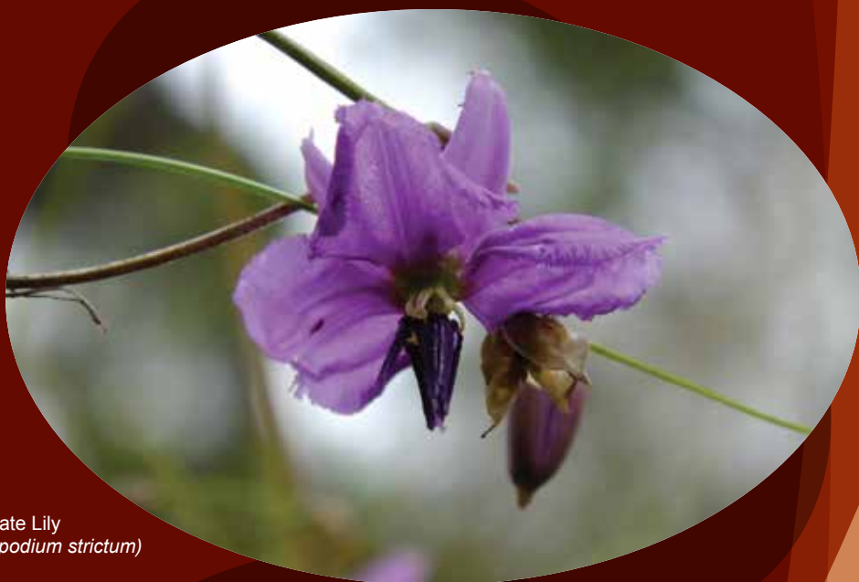
Chocolate Lily ( Arthropodium strictum )