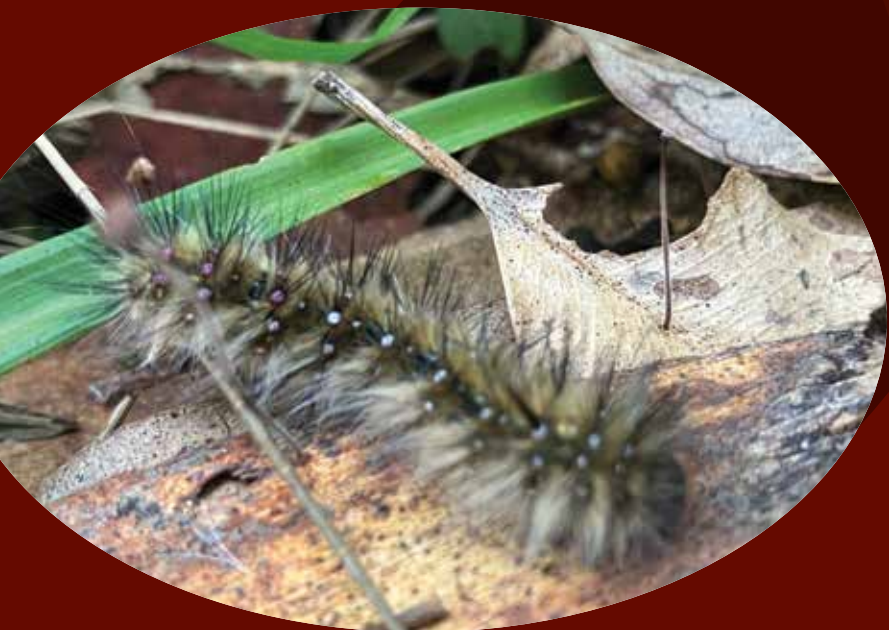
Common Anthelid Moth ( Anthela sp.)