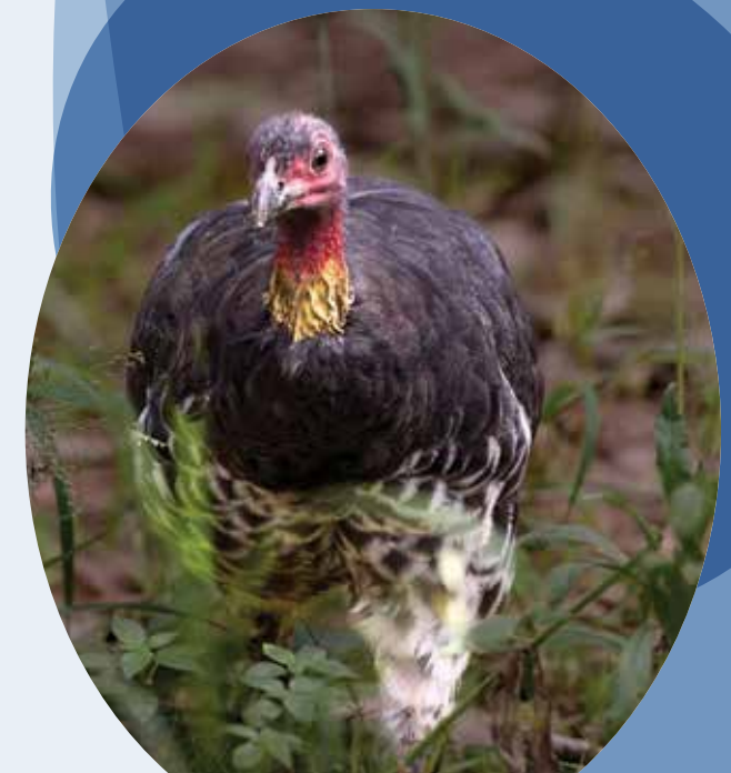
Australian Brush-turkey ( Alectura lathami )