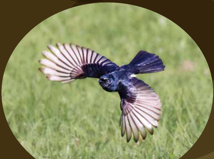
Willie Wagtail ( Rhipidura leucophrys )