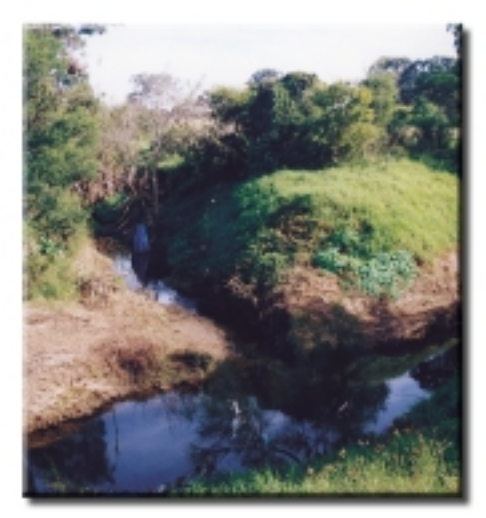
Green Valley, Orphan School Creeks.

The natural habitat for aquatic creatures, like fish, has been greatly reduced because land clearing means that the branches and leaves that were once in the water providing essential food sources and nutrients, are no longer present and able to perform this vital function. Logs also shelter fish from fast flowing waters and predators, and are very important for their survival.