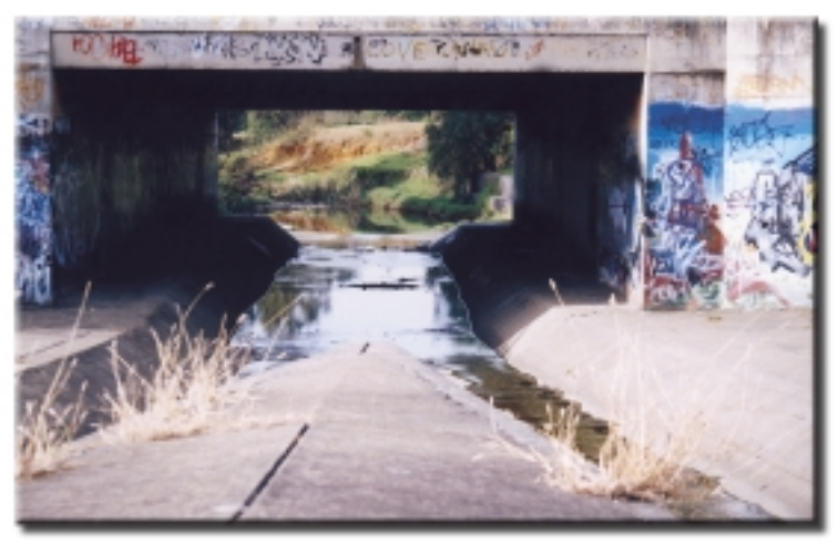
Where concrete meets the creek, with Orphan School Creek on the left and Clear Paddock Creek on the right.