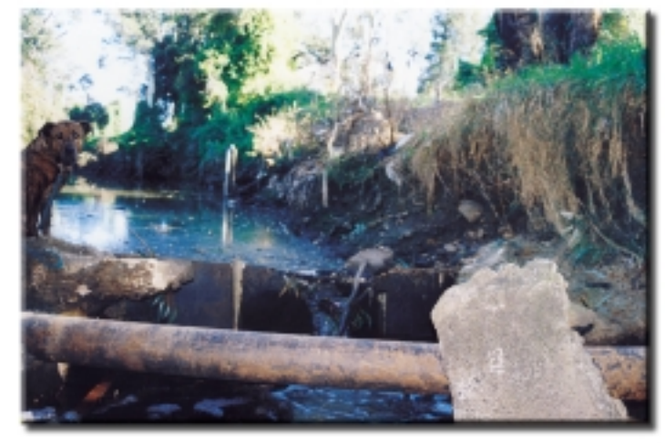
Weir at Canley Vale.