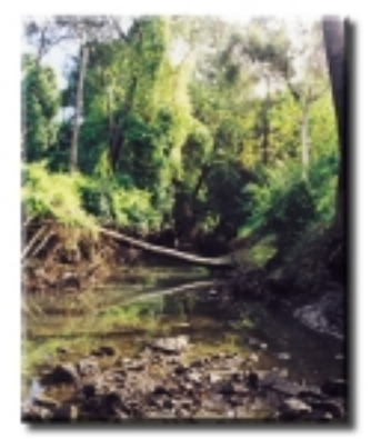
Entrance to St Elmos Creek, small tributary of Orphan School Creek at low tide.