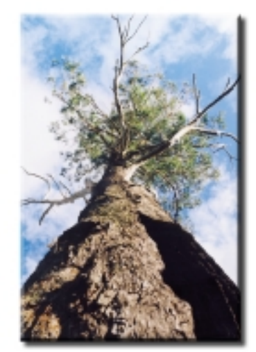
Tree - Johnston Park.

The Alluvial Woodland occurs along minor watercourse and next to riparian forests. It commonly includes trees such as Cabbage Gum (E amplifolia), Forest Red Gum (E. tereticonis) and dense stands of Swamp Oak (Casurina glauca). Good local examples of the Alluvial Woodland can be found at the Western Sydney Regional Park, Cowpasture Road, Horsley Park.