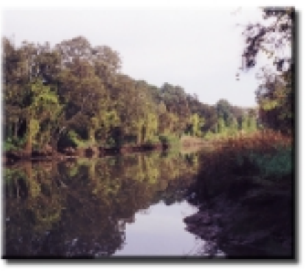
Prospect Creek at Carrawood Park.

Orphan School Creek is known as an "endangered ecological community": it is under threat from surrounding urban development and activity