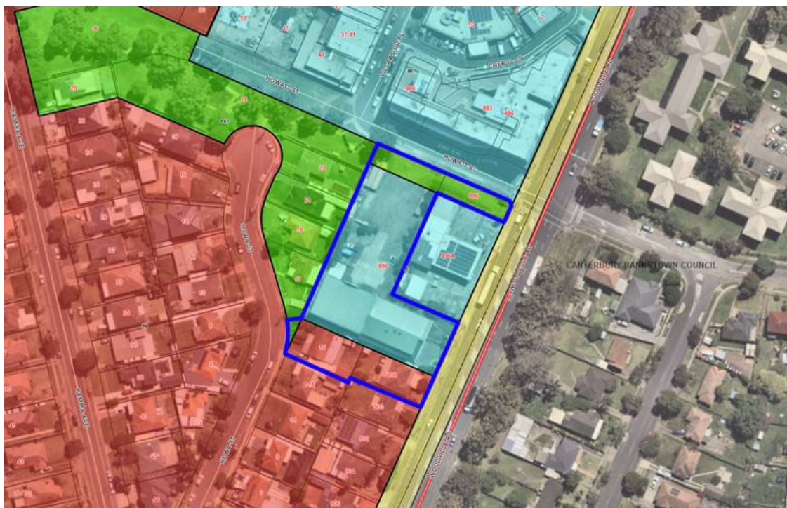
Figure 1 Subject site