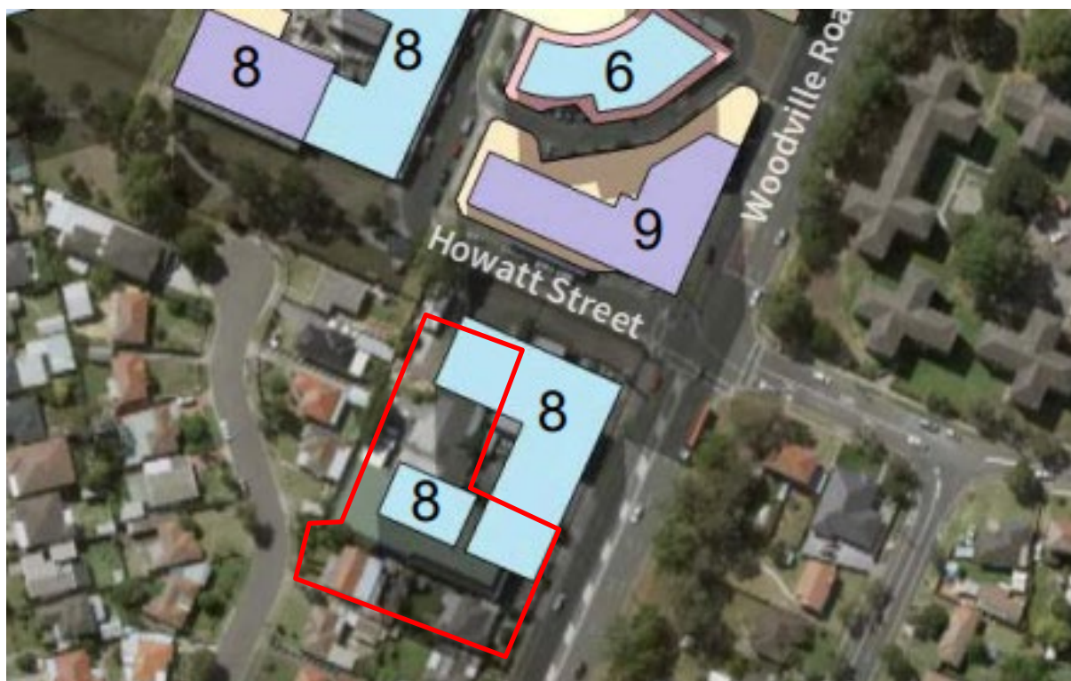
Figure 3 Intended built form outcome for the site under the UDS

4.2 For this group of sites, the UDS envisages a development that: