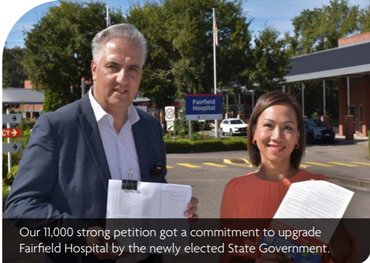
Our 11,000 strong petition got a commitment to upgrade Fairfield Hospital by the newly elected State Government.