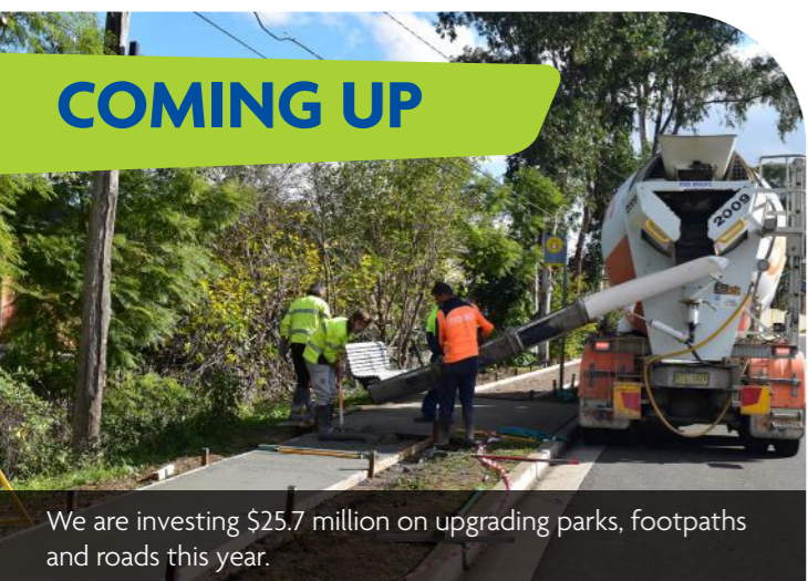
We are investing $25.7 million on upgrading parks, footpaths and roads this year.