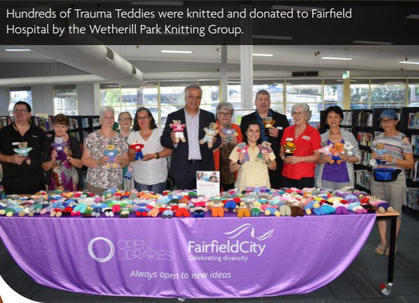
Hundreds of Trauma Teddies were knitted and donated to Fairfield Hospital by the Wetherill Park Knitting Group.