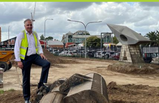
We are upgrading the International Monument at The Crescent which was established in 1977.

In addition, Carrawood Park, Carramar will be upgraded and feature the big bass playground. Work is due to be completed by the middle of this year.