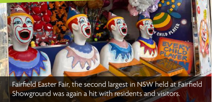
Fairfield Easter Fair, the second largest in NSW held at Fairfield Showground was again a hit with residents and visitors.