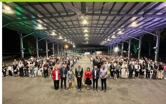
We have inducted over 800 new citizens at Fairfield Showground so far this year.