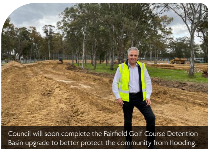
Council will soon complete the Fairfield Golf Course Detention Basin upgrade to better protect the community from flooding.