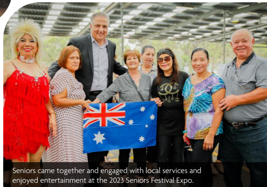
Seniors came together and engaged with local services and enjoyed entertainment at the 2023 Seniors Festival Expo.